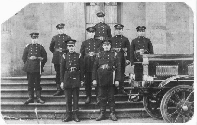
(Ashby Fire Brigade Outside Willesley Hall)

Given that the Ashby fire engine would have been horse-drawn, and the horses were kept in a field quite a distance from the fire station, it is surprising that they managed to ready themselves so quickly. However, the incident reminded me of something that was general practice in many