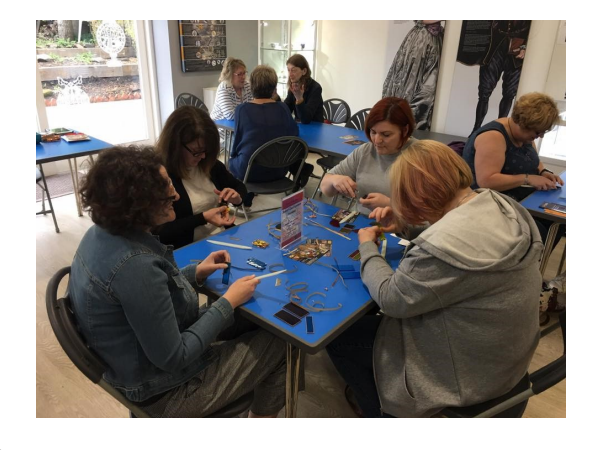
Stained Glass Window Experience