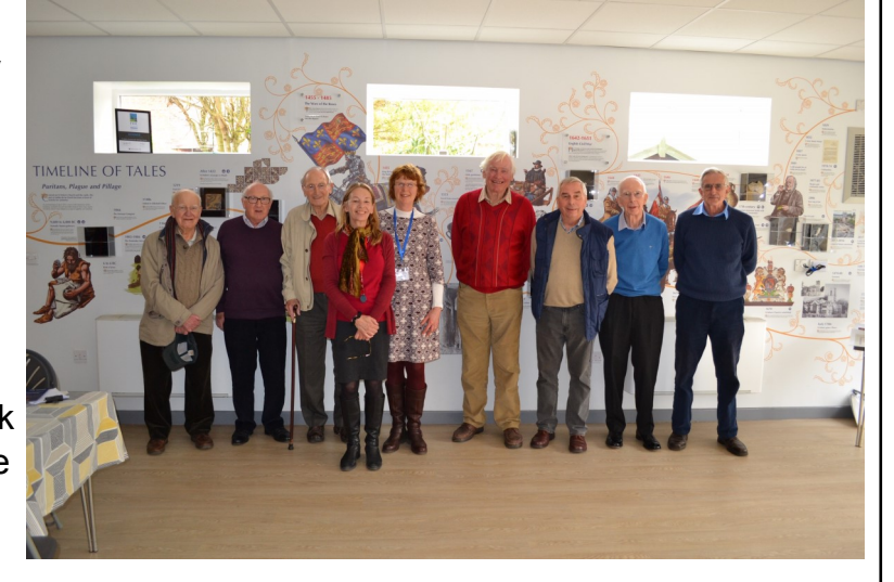
Packington Men's Group visit