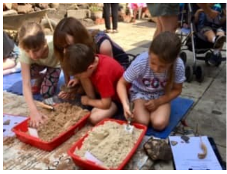
Left: Archaeology Day