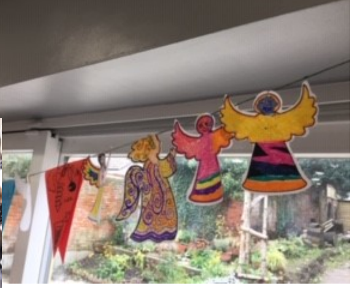
At October half term, the Heritage Centre was full of happy children taking part in our annual 'Big Draw.'