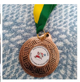
PRG took part in the rather snowy Ashby Santa fun run, in festive attire.