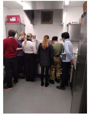
Earlier in the month, PRG also marked Shrove Tuesday with some expert pancake flipping.