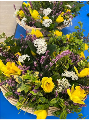
Thanks go to the ladies who worked hard to prepare the posies for our Mothering Sunday service. Much appreciated by all.