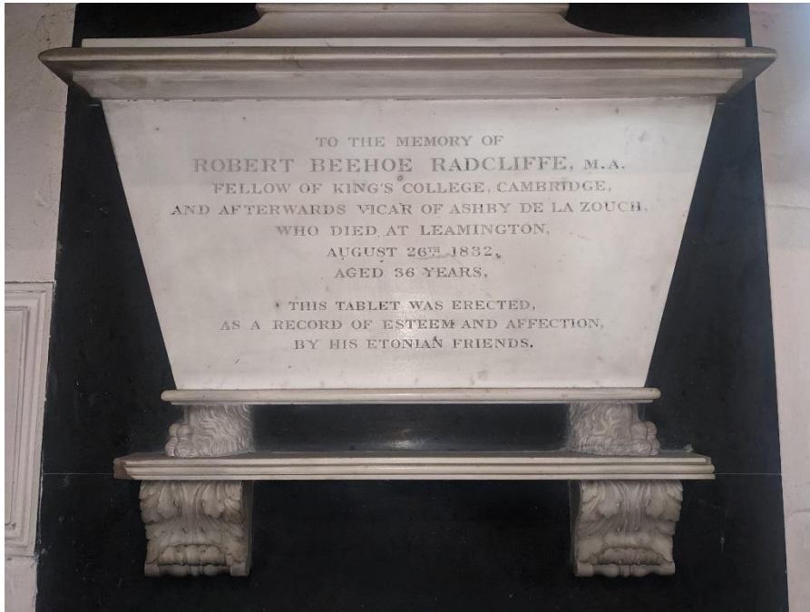
Memorial in the Chancel of St Nicholas Church, Kenilworth.

Kenilworth. As well as the monument in St Helen's, there is a memorial in the Chancel of St Nicholas, erected by his Eton friends and a large monument in the churchyard there, in an area near the church reserved for clergy.