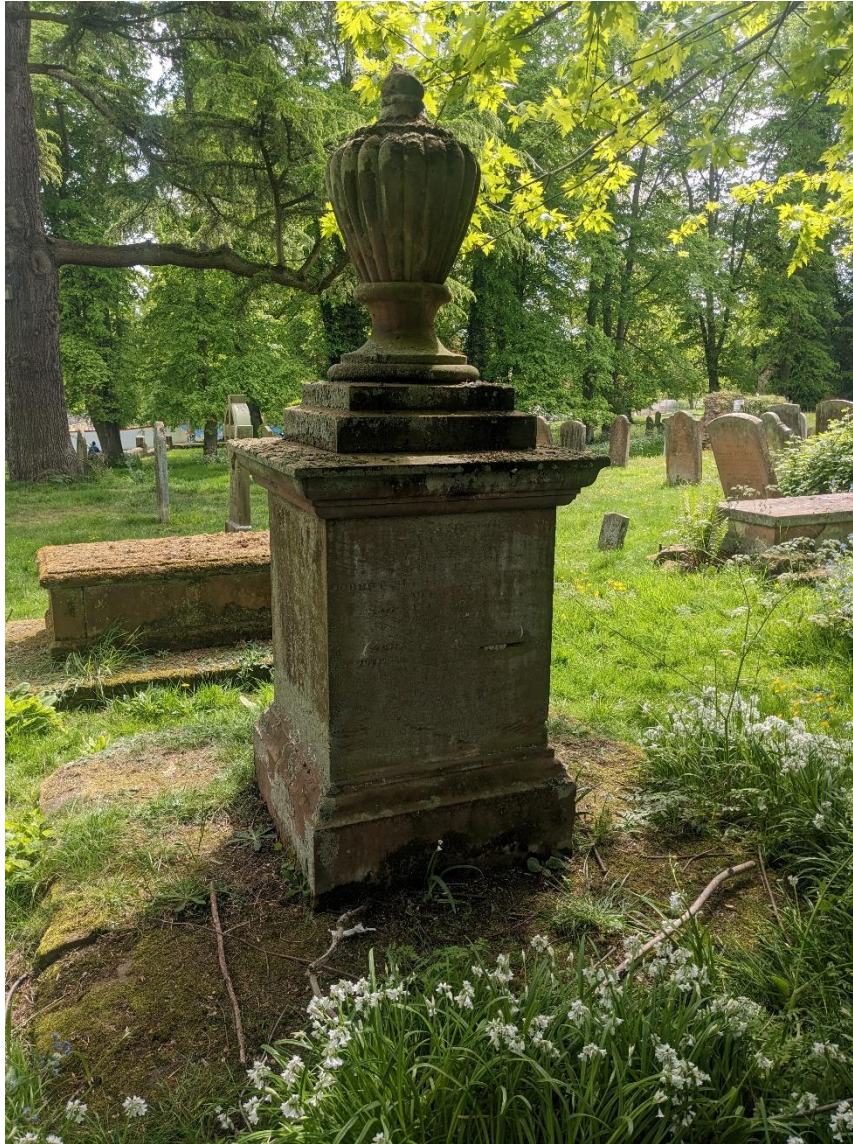
Monument in the churchyard of St Nicholas, Kenilworth.

It's a sad ending to a life which began with great promise. The son of a relatively poor family who attended Eton & Cambridge, played first class cricket and became a much-loved vicar, lost close family members in quick succession and suffered a long illness leading to his own early death. It may be some consolation to know that he was remembered with great affection by both his parishioners in Ashby and his fellow scholars at Eton.